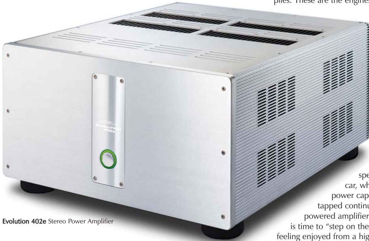
Evolution 402e Stereo Power Amplifier

Evolution e Series amplifiers start with massive power supplies. These are the engines of an amplifier and are custom designed for each Evolution e Series amplifier. The most powerful model, the Evolution 900e, includes a striking 6,000 watt power supply. This figure is akin to a engine with a very high horsepower rating specification. As in a car, where the full horsepower capability is not tapped continuously, a high powered amplifier is ready when it is time to "step on the gas". The visceral feeling enjoyed from a high horsepower car is the same that occurs when listening to music or viewing a movie with a powerful amplifier based system.