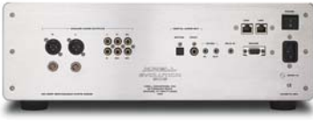
Cipher SACD/CD Player

Frequency response: 20 Hz to 20 kHz +0, -0.25 dB Signal-to-noise ratio: >112 dB, "A"-weighted Total harmonic distortion: <0.005% dB, 20 Hz to 20 kHz Power consumption: 61 W Analog audio outputs: 1 pair CAST via 4-pin bayonet connectors 1 pair balanced via XLR connectors 6 single-ended via RCA connectors Digital audio outputs: 1 S/PDIF via RCA connector 1 EIAJ optical via Toslink connector Remote control: 1 wireless IR remote 1 remote IR sensor input via 3-cond. 3.5mm conn. Control inputs/outputs: 1 RS-232 bi-directional interface 1 ea. 12 VDC trigger in/out via 3.5mm connector 1 ea. Krell CAN link in/out via RJ-45 connector Dimensions (WxHxD): 17.3 x 6.0 x 17.3 in. 438 x 153 x 438 mm Weight: 29 lb., 13.2 kg (unit only) 37 lb., 16.8 kg (as shipped)