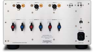
Evolution 403e Three-Channel Power Amplifier

Frequency Response: 20 Hz to 20 kHz +0, -0.18 dB <0.5 Hz to 120 kHz +0, -3 dB Signal-to-noise ratio: >106 dB, wideband, unweighted, referred to full power output >116 dB, "A"-weighted Gain: 25.4 dB Total harmonic distortion: <0.02% at 1 kHz, at 400 W, 8 Ω <0.15% at 20 kHz, at 400 W, 8 Ω Input impedance: CAST: 70 Ω; Balanced: 200 kΩ; Single-ended: 100 kΩ Input sensitivity: CAST: 3.04 mA RMS; Balanced or single-ended: 3.04 V RMS Output power (per channel, all channels driven): 400 W at 8 Ω; 800 W at 4 Ω Output voltage: 160 V peak-to-peak; 57 V RMS Output current: 37 A peak Slew rate: 100 V/μs Output impedance: <0.055 Ω at 20 Hz; <0.064 Ω, 20 Hz to 20 kHz Damping factor (referred to 8 Ω): >145 at 20 Hz; >125, 20 Hz to 20 kHz Power consumption: Standby: 2W; High current Standby: 370 W; Idle: 570 W; Maximum: 5000W Heat output: Standby: 7BTU/hr.; High current Standby: 1270 BTU/hr.; Idle: 1950 BTU/hr.; Maximum: 7700 BTU/hr. Inputs: 3 CAST via 4-pin bayonet connectors 3 balanced via XLR connectors 3 single-ended via RCA connectors Outputs: 3 pairs Krell binding posts Dimensions (WxHxD): 17.3 x 9.8 x 26.1 in. 438 x 248 x 662 mm Weight: 175 lb., 79.2 kg (unit only) 190 lb., 86 kg (as shipped)