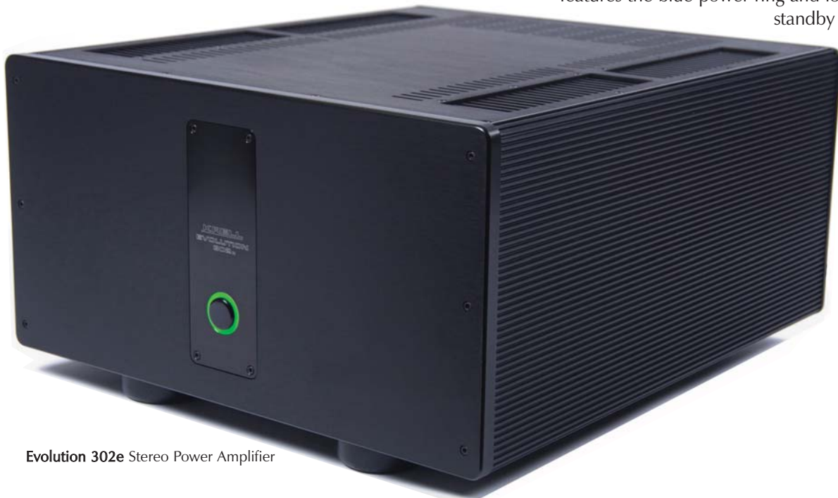
Evolution 302e Stereo Power Amplifier

standby mode shared by all Evolution e Series amplifiers.