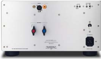
Evolution 900e Monaural Power Amplifier

Frequency response: 20 Hz to 20 kHz +0, -0.18 dB <0.5 Hz to 120 kHz +0, -3 dB Signal-to-noise ratio: >113 dB, wideband, unweighted, referred to full power output >122 dB, "A"-weighted Gain: 25.4 dB Total harmonic distortion: <0.02% at 1 kHz, at 900 W, 8 Ω <0.15% at 20 kHz, at 900 W, 8 Ω Input impedance: CAST: 70 Ω; Balanced: 200 kΩ; Single-ended: 100 kΩ Input sensitivity: CAST: 4.55 mA RMS; Balanced or single-ended: 4.55 V RMS Output power: 900 W at 8 Ω; 1800 W at 4 Ω; 3600 W at 2 Ω Output voltage: 240 V peak-to-peak; 85 V RMS Output current: 60 A peak Slew rate: 90 V/μs Output impedance: <0.023 Ω, 20 Hz to 20 kHz Damping factor (referred to 8 Ω): >350, 20 Hz to 20 kHz Power consumption: Standby: 2 W; High current Standby: 440W; Idle: 650 W; Maximum: 5000W Heat output: Standby: 7 BTU/hr.; High current Standby: 1500 BTU/hr.; Idle: 2200 BTU/hr.; Maximum: 7700 BTU/hr. Inputs: 1 CAST via 4-pin bayonet connector 1 balanced via XLR connector 1 single-ended via RCA connector Outputs: 1 pair Krell binding posts Dimensions (WxHxD): 17.3 x 9.8 x 26.1 in. 438 x 248 x 662 mm Weight: 175 lb., 79.2 kg (unit only) 190 lb., 86 kg (as shipped)