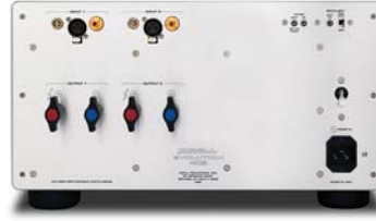
Evolution 402e Stereo Power Amplifier

Frequency response: 20 Hz to 20 kHz +0, -0.18 dB <0.5 Hz to 120 kHz +0, -3 dB Signal-to-noise ratio: >106 dB, wideband, unweighted, referred to full power output >116 dB, "A"-weighted Gain: 25.4 dB Total harmonic distortion: <0.02% at 1 kHz, at 400 W, 8 Ω <0.15% at 20 kHz, at 400 W, 8 Ω Input impedance: CAST: 70 Ω; Balanced: 200 kΩ; Single-ended: 100 kΩ Input sensitivity: CAST: 3.04 mA RMS; Balanced or single-ended: 3.04 V RMS Output power (per channel, all channels driven): 400 W at 8 Ω; 800 W at 4 Ω Output voltage: 160 V peak-to-peak; 57 V RMS Output current: 37 A peak Slew rate: 100 V/μs Output impedance: <0.055 Ω at 20 Hz; <0.064 Ω, 20 Hz to 20 kHz Damping factor (referred to 8 Ω): >145 at 20 Hz; >125, 20 Hz to 20 kHz Power consumption: Standby: 2W; High current Standby: 260 W; Idle: 390 W; Maximum: 3800W Heat output: Standby: 7BTU/hr.; High current Standby: 890 BTU/hr.; Idle: 1300 BTU/hr.; Maximum: 6400 BTU/hr. Inputs: 2 CAST via 4-pin bayonet connectors 2 balanced via XLR connectors 2 single-ended via RCA connectors Outputs: 2 pairs Krell binding posts Dimensions (WxHxD): 17.3 x 9.8 x 22.1 in. 438 x 248 x 560 mm Weight: 135 lb., 61.1 kg (unit only) 150 lb., 67.9 kg (as shipped)