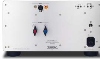
Evolution 600e Monaural Power Amplifier

Frequency response: 20 Hz to 20 kHz +0, -0.18 dB <0.5 Hz to 120 kHz +0, -3 dB Signal-to-noise ratio: >110 dB, wideband, unweighted, referred to full power output >119 dB, "A"-weighted Gain: 25.4 dB Total harmonic distortion: <0.02% at 1 kHz, at 600 W, 8 Ω <0.15% at 20 kHz, at 600 W, 8 Ω Input impedance: CAST: 70 Ω; Balanced: 200 kΩ; Single-ended: 100 kΩ Input sensitivity: CAST: 3.72 mA RMS; Balanced or single-ended: 3.72 V RMS Output power: 600 W at 8 Ω; 1200 W at 4 Ω; 2400 W at 2 Ω Output voltage: 196 V peak-to-peak; 69 V RMS Output current: 49 A peak Slew rate: 100 V/μs Output impedance: <0.030 Ω, 20 Hz to 20 kHz Damping factor (referred to 8 Ω): >270, 20 Hz to 20 kHz Power consumption: Standby: 2W; High current Standby: 260 W; Idle: 410 W; Maximum: 3800W Heat output: Standby: 7BTU/hr.; High current Standby: 890 BTU/hr.; Idle: 1400 BTU/hr.; Maximum: 5500 BTU/hr. Inputs: 1 CAST via 4-pin bayonet connector 1 balanced via XLR connector 1 single-ended via RCA connector Outputs: 1 pair Krell binding posts Dimensions (WxHxD): 17.3 x 9.8 x 22.1 in. 438 x 248 x 560 mm Weight: 135 lb., 61.1 kg (unit only) 150 lb., 67.9 kg (as shipped)