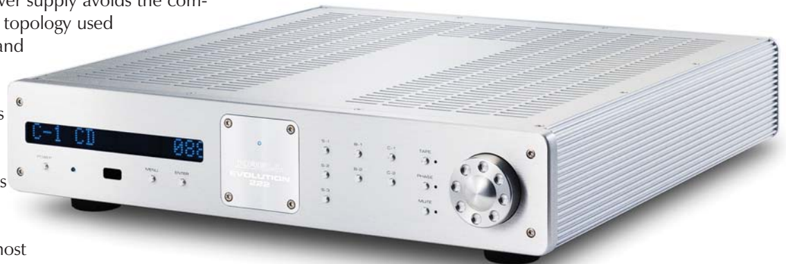
Phantom II Stereo Preamplifier