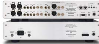
Phantom Stereo Preamplifier

Frequency response: 20 Hz to 20 kHz ±0.02 dB 0.35 Hz to 720 KHz +0, -3 dB Signal-to-noise ratio (ref. 4 mA RMS CAST or 4 V RMS balanced output): >100 dB, wideband, unweighted; >109 dB, "A"-weighted Gain: 12 dB (CAST or balanced output); 6 dB (single-ended output) Total harmonic distortion plus noise (ref. 4 mA RMS CAST or 4 V RMS balanced output): <0.003%, 20 Hz to 20 kHz Input impedance: CAST: 25 Ω; Balanced: 40 kΩ; Single-ended: 20 kΩ Output impedance: CAST: >1 M Ω; Balanced: 250 Ω; Single-ended: 125 Ω Input overload: CAST: 12 mA RMS; Balanced: 10 V RMS; Single-ended: 6.5 V RMS Output overload: CAST: 16 mA RMS; Balanced: 16 V RMS; Single-ended: 8 V RMS Volume control: Balanced, current mode, 16-bit, discrete R-2R ladder Inputs: 2 pairs CAST via 4-pin bayonet connectors 2 pairs balanced via XLR connectors 3 pairs single-ended via RCA connectors Tape input: 1 pair single-ended via RCA connectors Main outputs: 2 pairs CAST via 4-pin bayonet conn. 1 pair balanced via XLR connectors 1 pair single-ended via RCA connectors Tape output: 1 pair single-ended via RCA conn., buffered Control inputs/outputs: 1 RS-232 in via 9-pin D-sub connector 1 remote IR detector in via 3-conductor 3.5mm connector 1 12 VDC trigger in via 2-conductor 3.5mm connector 1 ea. Krell CAN link in/out via RJ-45 connector 2 programmable 12 VDC trigger out via 2-conductor 3.5mm connector