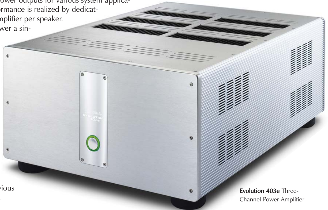
Evolution 403e Three-Channel Power Amplifier

The Evolution e Series consists of models of different channel configurations and power outputs for various system applications. Ultimate performance is realized by dedicating one monaural amplifier per speaker. Only required to power a single speaker, it is easy to understand why this is the preferred configuration. Additional Evolution e Series models include two channel and three channel options. A new eco-friendly mode reduces standby power draw dramatically. Standby power draw has been reduced of over 99.5% from the previous amplifier generation.