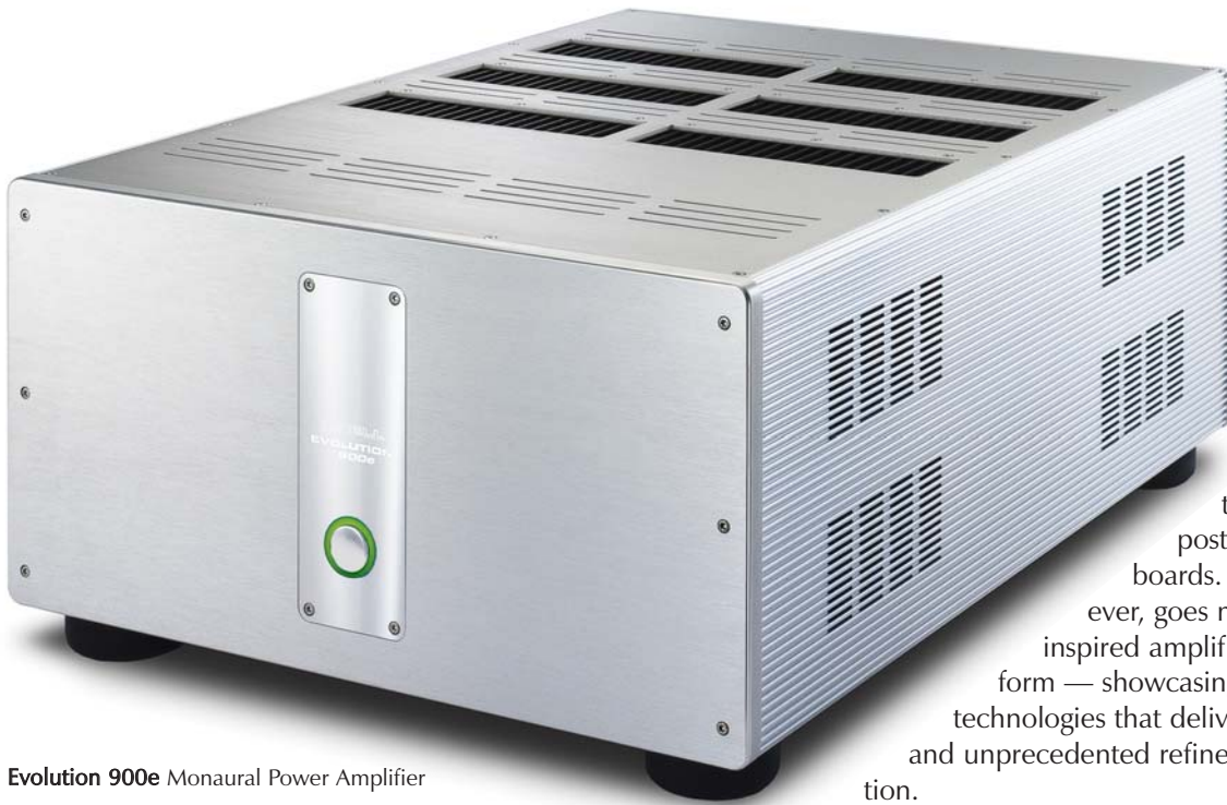
Evolution 900e Monaural Power Amplifier

Evolution e Series amplifiers exude uncompromised build quality with massive non-resonant chassis, solid alloy faceplates accentuated by striking diamond-cut center panels, huge binding posts, and military-grade circuit boards. The engineering story, however, goes much deeper. These inspired amplifiers, represent a new platform — showcasing innovative, breakthrough technologies that deliver virtually unlimited power and unprecedented refinement in audio reproduction.