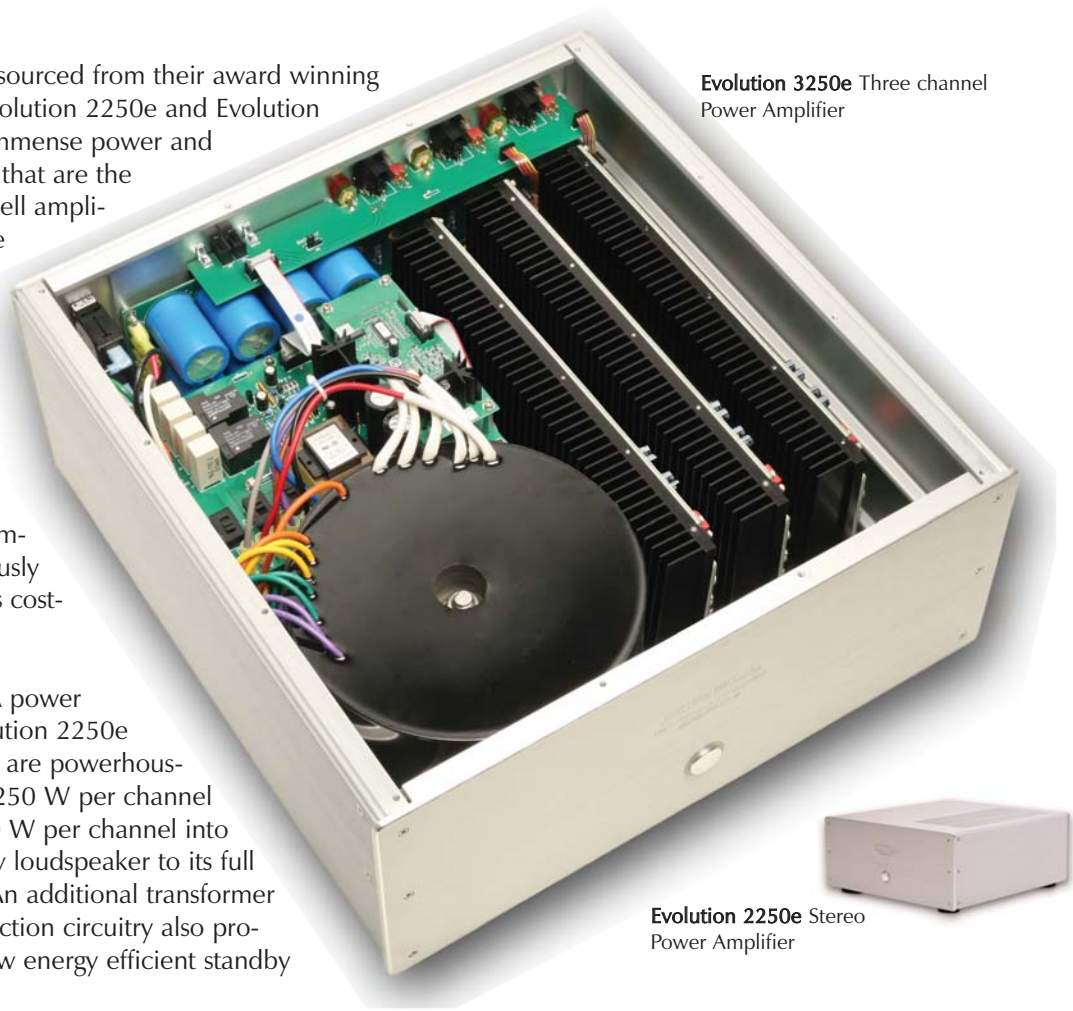
Evolution 3250e Three channel Power Amplifier

Housed in elegant silver or black brushed anodized aluminum, the Evolution 2250e and Evolution 3250e are the smallest amplifiers in the Evolution e Series, Featuring a 7" high profile, the new amplifiers bring prodigious power to applications requiring smaller amplifiers without sacrificing sonic performance. The stylish Aluminum faceplate features the blue power ring and low draw standby mode shared