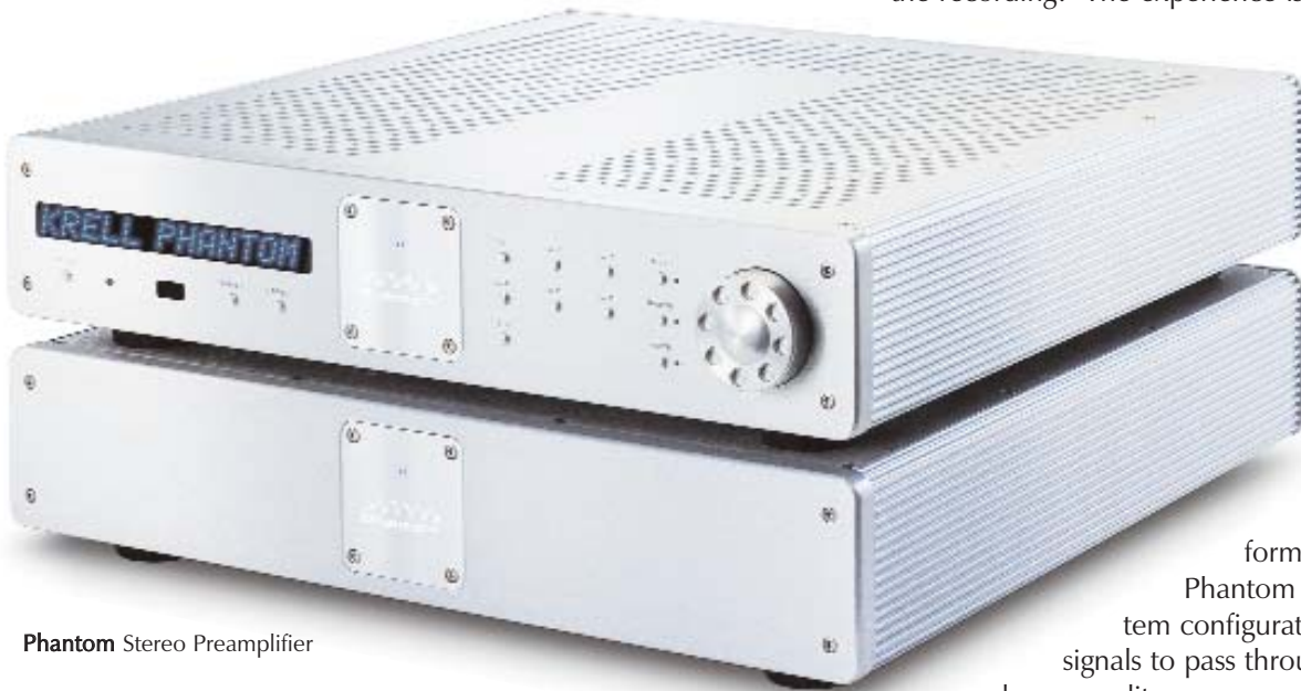
Phantom Stereo Preamplifier

Often overlooked, the preamplifier is a critical component in the signal chain. A small signal must be carefully amplified without damaging the delicate staging and dimensional components of the music. The Phantom Preamplifier, using a combination of advanced technologies and skillful design, elevate this task to an art form. Music emanates from an expanse that outlines the recording venue, transporting you to the moment of creation. With the Phantom Preamplifier, musicians appear, silhouetted by the air about them, filling the room with a mesmerizing depiction of the recording. The experience is engaging, captivating, and entrancing.